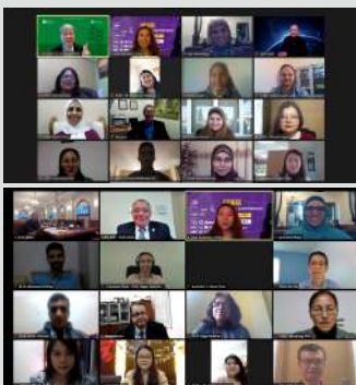
ITET 2020-Virtual Conference