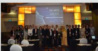
ITET 2019 in Singapore